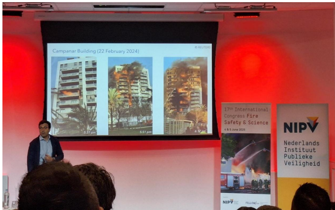
Christian Maluk presenting.

The presentation covered key aspects related to fires in residential buildings, focusing on the spread of fire and smoke through exterior facades. It explains how fires can spread through facades, highlighting the influence of modern facade design and construction. The presentation examined how these factors impact the fire strategy of a residential building, considering fire safety measures, provisions, and contingencies that can be implemented to manage such situations. Additionally, it provided case studies to evaluate events involving the spread of fire through facades.